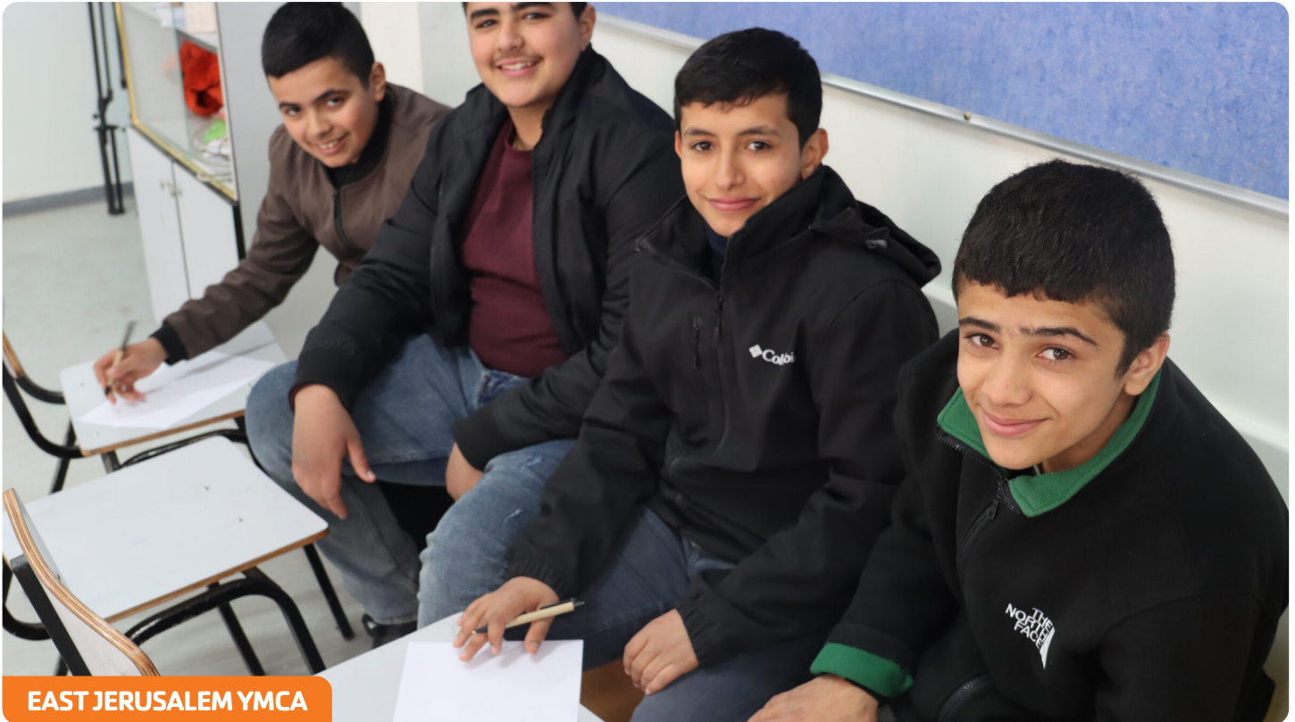
EAST JERUSALEM YMCA

Many children and teens in the West Bank and Gaza are negatively impacted by chronic political tension and violence. Studies show that more than 36% of these young people suffer from Post-Traumatic Stress Disorder (PTSD). Many also have life altering injuries due to violence and/or incarceration. As a result, children experience high levels of anxiety, depression and hopelessness.