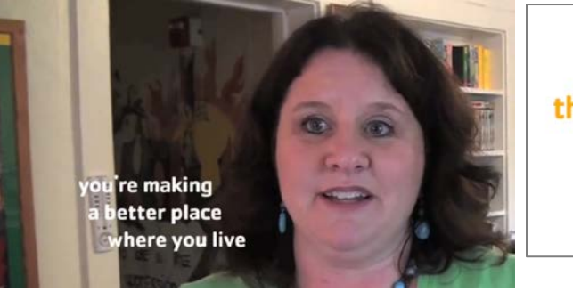
Closing shot – show the relationships that were built.