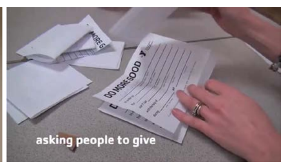
Have "B roll" for illustrating the point the quote is making.